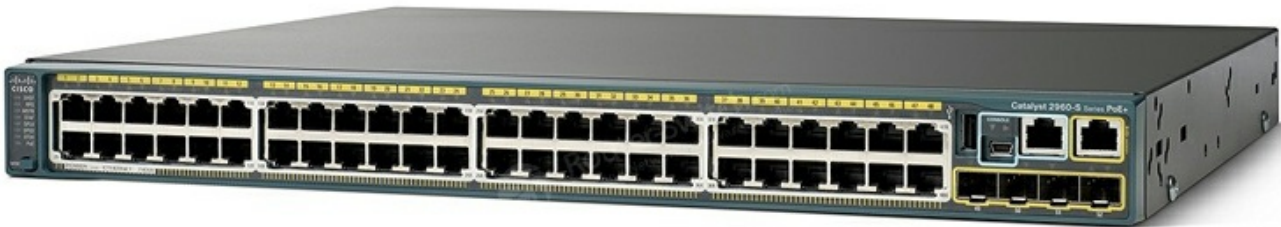
Table 1 shows the Quick Spec of the WS-C2960S-48LPS-L.

Figure 1 shows the appearance of the WS-C2960S-48LPS-L.