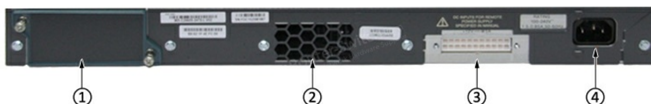
Figure 3 shows the back panel of the WS-C2960S-48LPS-L.