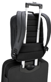
Dell Adapter – USB-C to DisplayPort Dell Premier Slim Backpack 14.