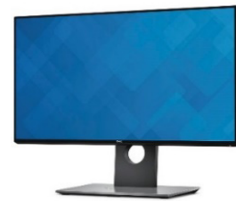
Dell 24 Monitor | P2417H