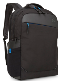
Dell Professional Backpack 15